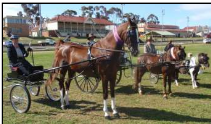
2015 Parkes Show. Supreme Harness Exhibit judged by Greg Little.