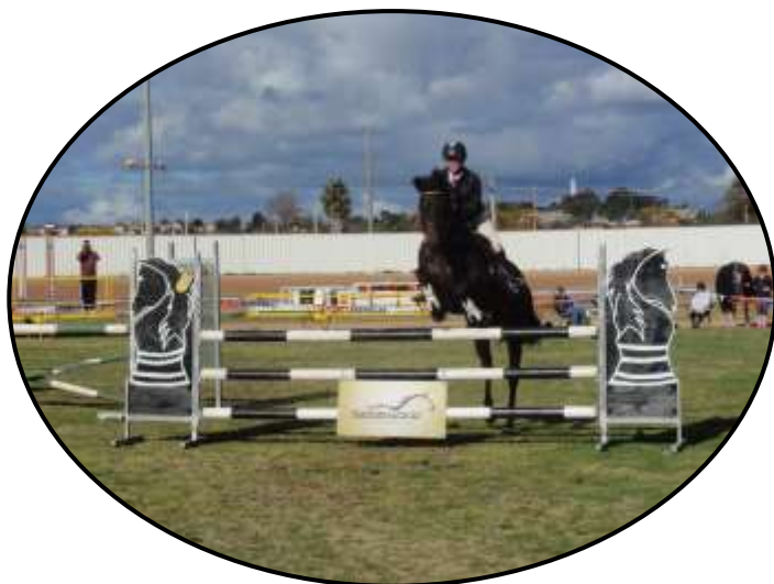
2012 Parkes Show Showjumping event