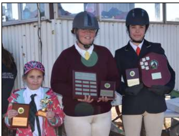
2018 Parkes Show Senior & Junior Horsemanship Award Recipients