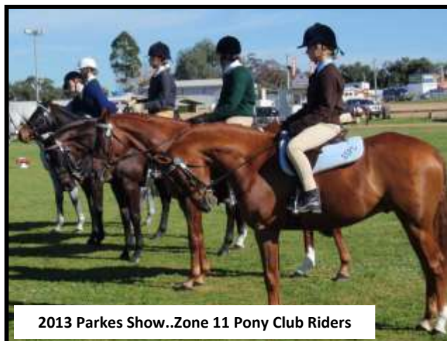
2013 Parkes Show..Zone 11 Pony Club Riders